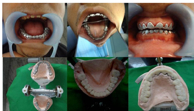
Fig. 5. Intraoperative photograph of PFM Crown Fabrication