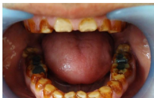
Fig. 2. Restored Teeth