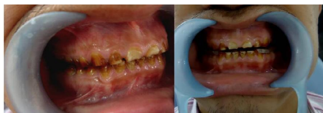
Fig. 1. Preoperative view