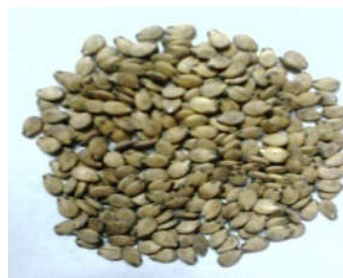
Whole seeds of C. vulgaris

Watermelon seeds are easily available during summer season. Though it is not an oilseed but many researchers have reported that C. vulgaris seed kernels contain about 52.6% oil, so these are good source of energy (628k.cal) (C. Gopalan et al. , 1971). C. Gopalan has listed watermelon seed kernels under nuts and oilseeds. Characteristics and compositions of C. vulgaris , pumpkin and paprika seed kernel oils and flours were evaluated by Tarek. A. El-Adawy et al. (Tarek. A, El-Adawy et al. , 2001). Elezuo et al. in the year 2011 evaluated the nutrient composition of some unconventional feedstuffs. Whole seed of C. vulgaris was one among them (Elezuo et al. , 2011).