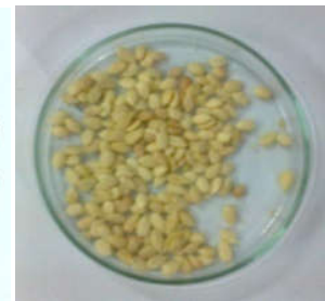
Seed kernels of C. vulgaris