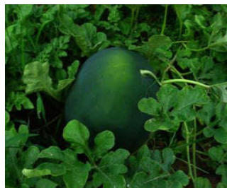
C. vulgaris plant

assumed. They are as follows- Citrullus naudinianus , C. colocynthis , C. rehmi , Citrullus amarus , with the synonyms C. caffer and C. lanatus var. citroides , C. ecirrhosus . (Guillaume Chomicki, Susanne S. Renner 2014). The species of watermelon which is widely available and eaten in Kolkata (India) was known as Citrullus vulgaris . It is round in shape, has dark green colored rind and red pulp which is sweet in taste.