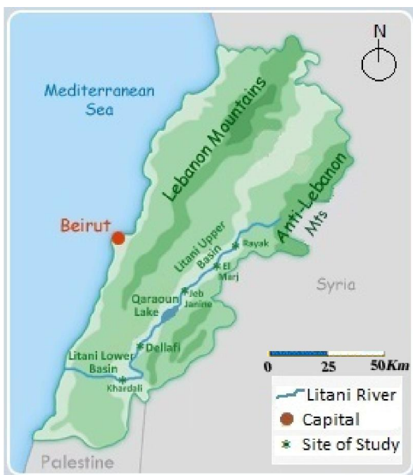
Figure 1. Study sites at Upper and Lower Litani River Basins, Lebanon.

Situated within the boundaries of Lebanon, Litani River runs for about 170 km through Bekaa Valley in a south- westerly direction to meet the Mediterranean Sea (Figure 1).