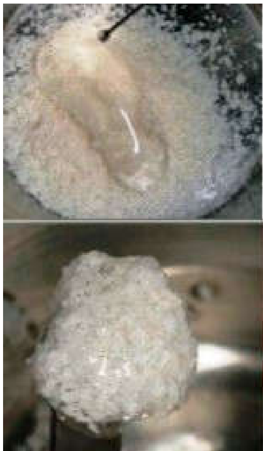
Figure 6. Hyaluronic acid mixed with bone graft