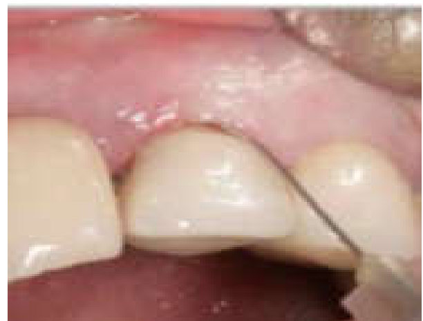
Figure 2. Application on soft tissue

The topical application of a high-molecular weight exogenous hyaluronan based gel has been proposed to have some potential in inducing periodontal healing in patients with gingivitis, during randomized, controlled double blind studies conducted by Vangelisti et al and Pagnacco et al. (Vangelisti et al. , 1997) Also Dr. Yashika Jain carried out a study on gingivitis subjects and treated them with use of 0.2% Hyaluronic acid gel topically as an adjunct scaling and root planing and concluded that hyaluronic acid is effective in treatment of gingivitis. (Yashika Jain, 2013) (Figure 2)