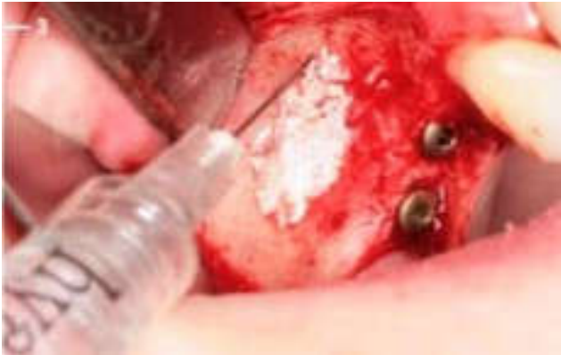
Figure 5. Use of hyaluronic acid in sinus lift procedure