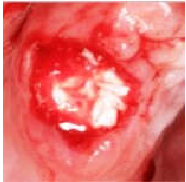
Figure 3. Used in socket preservation

or ridge preservation. Recently Dr.kotsakis described flapless technique "socket plug" technique using collagen sponge for socket preservation post extraction. (Kotsakis, 2014) (Figure 3) It is proposed that when collagen sponge was moistened with Hyaluronic acid gel and grafted in extraction socket proved better results than collagen sponge used alone. (Figure 4)