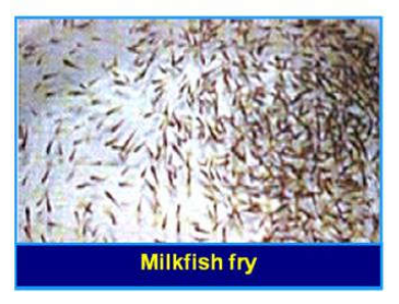
Fig. 3. Milk fish fry collection area in Chinnapalam, Pamban coast of Tamilnadu