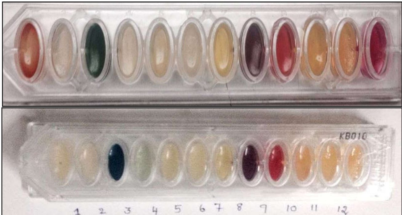
Fig. 2. Biochemical test using Kits –Culture-3 and Culture-5

From the above table it is clear that the microbial flora consists of Streptococcus sps and Staphylococcus aureus in 2 samples (culture 3, culture 5).