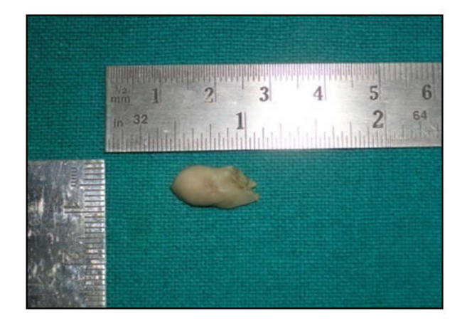
Fig. 2. On macroscopic examination lesion was elongated, whitish in color with smooth surface and soft consistency