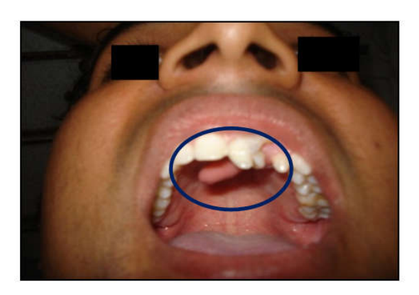
Fig. 1. Soft, cylindrical growth, 4×1 cm<sup>2</sup> in dimension, pedunculated, situated nearnasopalatine foramen