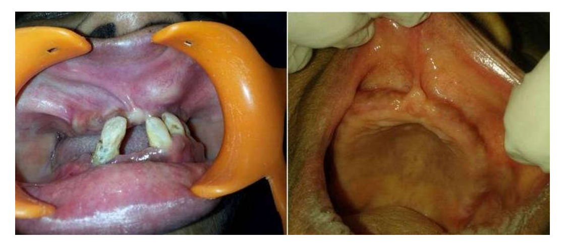
Figure 2. Intra-oral photograph showing obliteration of the left maxillary vestibule