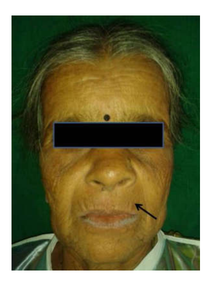
Figure 1. Extra-oral photograph showing fullness below the left nostril

Microscopic section revealed cyst lined by ulcerated stratified squamous epithelium. Walls showed fibrous tissue with dense acute and chronic inflammation and skeletal muscle fibres (Figure 7). Based on the clinical, imaging and histopathologic findings, a final diagnosis of nasolabial cyst was made. The post operative period was uneventful.