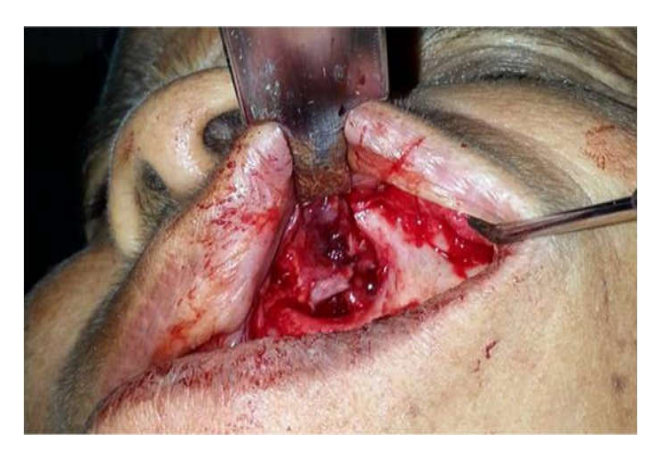
Figure 6. Intra-operative view showing the excision was done via an intra-oral approach