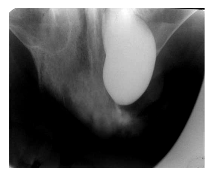
Figure 3. Maxillary anterior occlusal view show well-defined, elliptical, radio-opaque lesion following injection of contrast medium