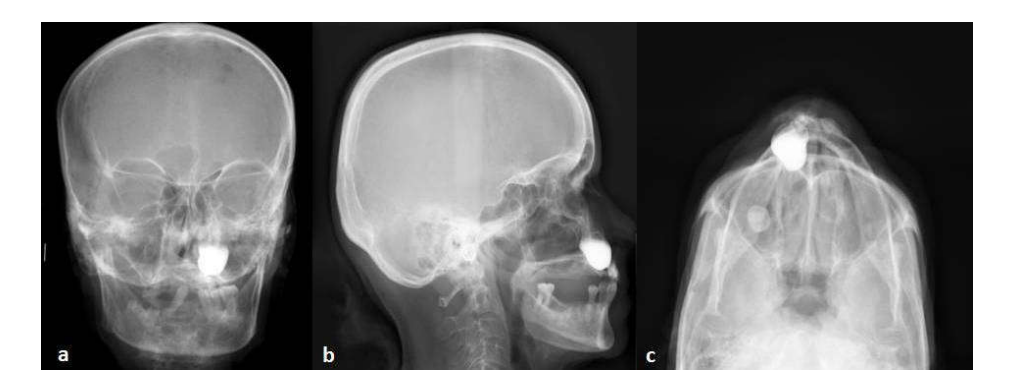
Figure 4. Postero-anterior, lateral skull and submentovertex views showing the extent of the lesion in three dimensions