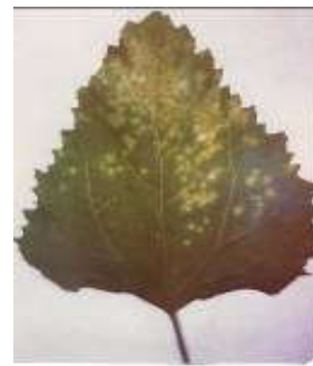
Fig. 1. Symptoms of chlorotic local lesions on Ch. amaranticolor leaf, sap inoculated by ZYMV

Host range: Of the 22 plant species tested for susceptibility to ZYMV by sap-inoculation, most species belonging to the family cucurbitaceae, namely Cucurbita pepo , C. moschata , Cucumis melo , Citrullus lanatus , and Luffa acutangula , one species to Chenopodiaceae, Ch. amaranticolor , and one to Euphorbiaceae, Euphorbia peplus , were found susceptible (Table 1). The virus caused severe yellow mosaic, blistering of leaf lamina, leaf reduction and deformation with deformed fruit covered with knobs on, Cucurbita pepu , C. moschata , Cucumis melo , Citrullus lanatus . Symptoms of veinbanding and yellowing with leaf reduction were developed on Luffa acutangula sap-inoculated by virus extract without deformation on leaves or fruits after one month of inoculation. Mild mottling with slight fruit deformation was observed on Cucumis sativus . Ch. amaranticolor developed chlorotic local lesions on the leaves sap-inoculated by crude extract from squash infected plants after 10 days of inoculation (Fig.1), which turned to necrotic after plant decays. Sap-inoculated leaves of Euphorbia peplus developed necrotic local lesions after 20 days of inoculation.