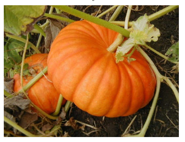
Fig. 1. Pumpkin (Cucurbita maxima)

Seed kernels of pumpkin were rich in oil and protein. It contains considerable amounts of P, K, Mg, Mn, and Ca. Oil extracted from the seeds is high in unsaturated fatty acids with linoleic and oleic acids as the major acids.