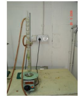
Soxhlet Apparatus (Extract done through it)