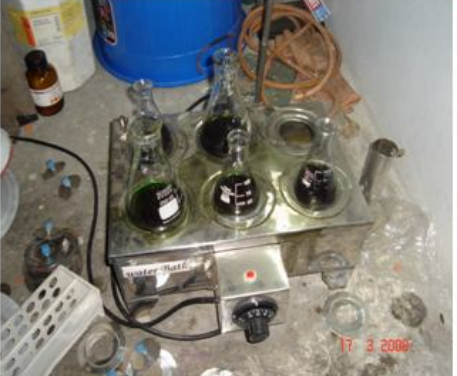
Extract evaporating in water bath