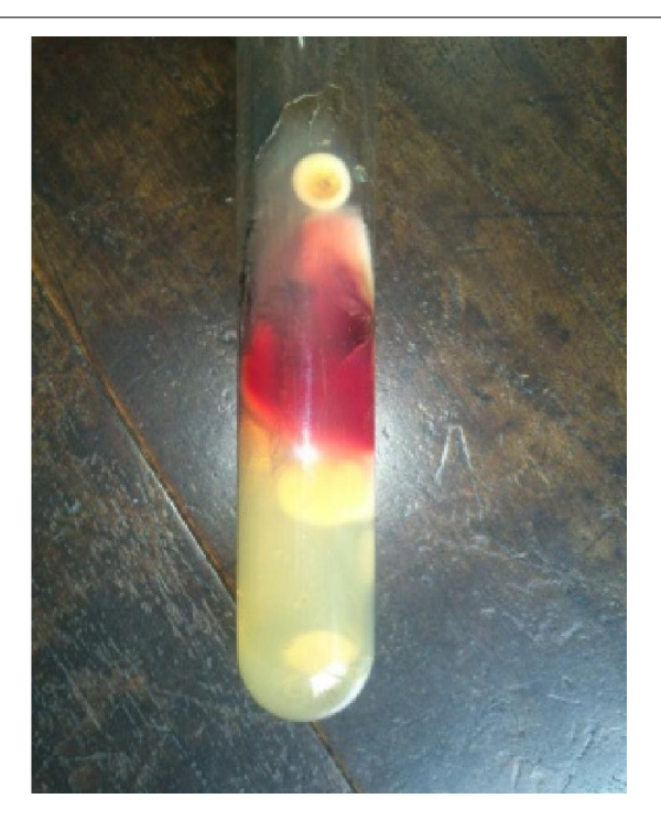
Culture tube of P.marneffii