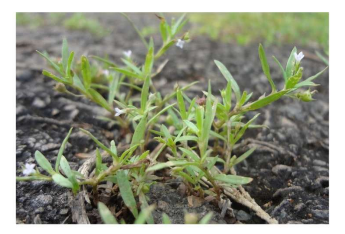
Fig. 1. Habit of the plant

Oldenlandia corymbosa (L.) Lamk. (Fig. 1.) is a procumbent herb with many branches on the stem. Rooting occurs at the nodal region. Leaves are sessile, simple entire, opposite, with interpetiolar stipules. Each peduncles has two flowers that are bisexual, tertra to pentamerous, polysepalous, gamopetalous. 5 stamens are epipetalous, inserted in the corolla tube, alternate with the corolla tube. Ovary is bicarpellary syncarpous and is inferior. Fruit is a capsule.