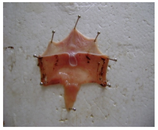
Group I (Ethanol)