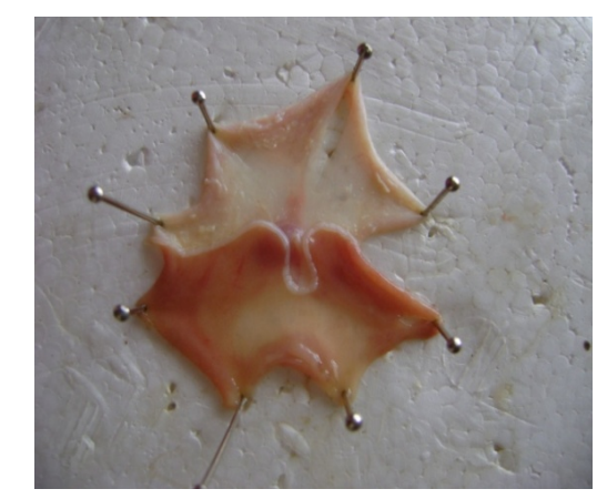
Group IV (Plant extract 1000mg/kg)