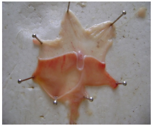
Group II (Omeprazole)