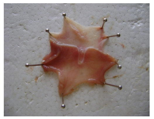
Group III (Plant extract 500mg/kg)