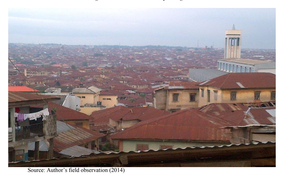
Fig. 1. The congestion of the urban centres