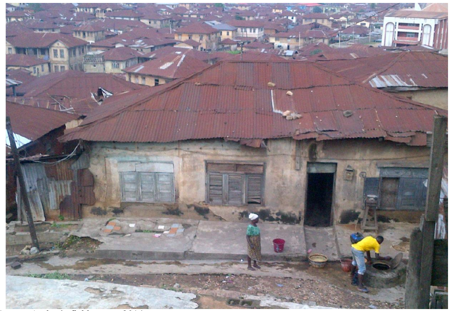
Plate 4. A typical housing quality in one of the slum Area in Ibadan