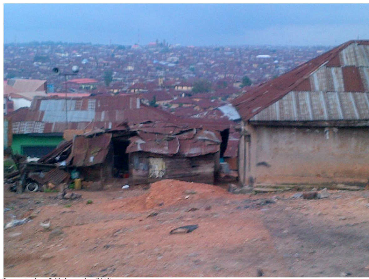
Plate 2. Showing views of urban complexes in Ibadan (bere Area)