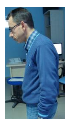
Fig. 1. Patient has dorsal kyphosis and head bent position due to AS

following subconjunctival anesthesia. Side effects such as increased intraocular pressure or any problem related with injection were not observed. However patient complained from shadowing in his right eye. The examination showed that the implant was behind the lens and in pupillary area in both eyes (Fig. 3). In both eyes, posterior capsular and nuclear cataract were developed. On his last examination after 3 months, intraocular inflammatory signs increased again in both eves and thus oral azathioprine, topical pred forte, cycloplegic solution and subtenon depomedrol were administered. Despite control of inflammation, visual acuity was finger counting at 3 meter in right eye and 2 meter in left eye. Intraocular pressure was 17 mmHg and 19 mmHg in right and left eyes, respectively. Posterior synechia was present in both eyes being more intense in the left. Cataract surgery was planned in both eyes after control of inflammation and bilateral YAG laser iridotomy was performed to both eyes as a precaution for glaucoma.