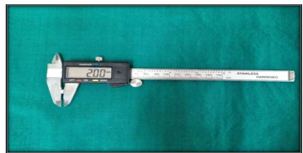
Fig. 2 Measurements of the moulds confirmed with a vernier calliper

Preparation of Specimens – 120 specimens were prepared using cylindrical Teflon moulds of 4mm diameter and 2mm height and the measurements of the moulds were confirmed with a vernier calliper (Fig. 2).