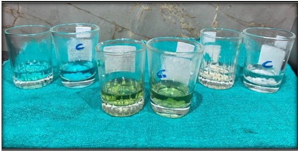
Fig. 3. Immersed samples

Subgroup 2c – Zirconomer Improved immersed in Freshclor 20 samples of each material were immersed in 10 ml of the three mouthwashes at 37°C ±2°C for 7 days (Fig. 3).