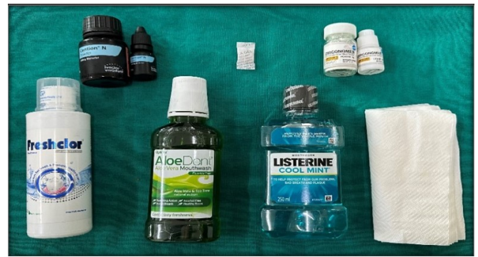
Fig.1. Materials used in the study

Preparation of Specimens – 120 specimens were prepared using cylindrical Teflon moulds of 4mm diameter and 2mm height and the measurements of the moulds were confirmed with a vernier calliper (Fig. 2).