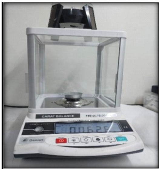
Fig.4 Digital analytical weighing scale (Genius Electronic)

After 7 days, they were removed and washed. The adherent water was wiped with a tissue paper and the samples were waved in air for 15 seconds and weighed ( W_2 ). Thereafter, for determination of solubility, specimen were then dehydrated in a vacuum desiccator for 24 hours and weighed again; this weight was termed as W_3 ( \mu\text{g} ) (Fig.4).