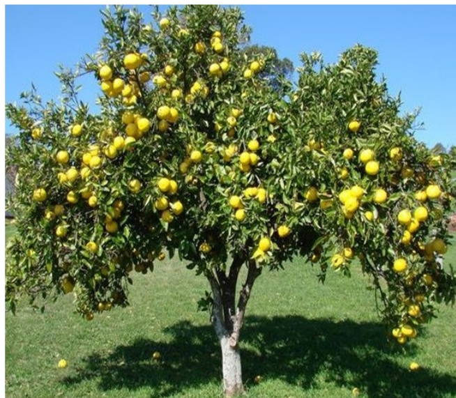
Figure 1. Grapefruit tree ( Citrus paradisi )