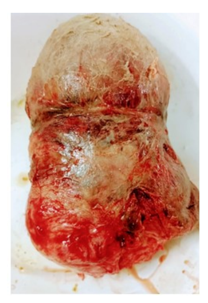
Figure 5. Gross section of Huge cervical fibroid after removal