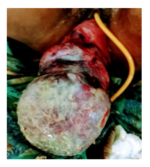
Lateral ant posterior cervical lip.

After that patient kept in supine position, the total abdominal hysterectomy was performed. Both the fallopian tubes were removed Both the ovaries preserved. Intraoperative 1 unit packed cell was transfused. Patient withstood the procedure well.