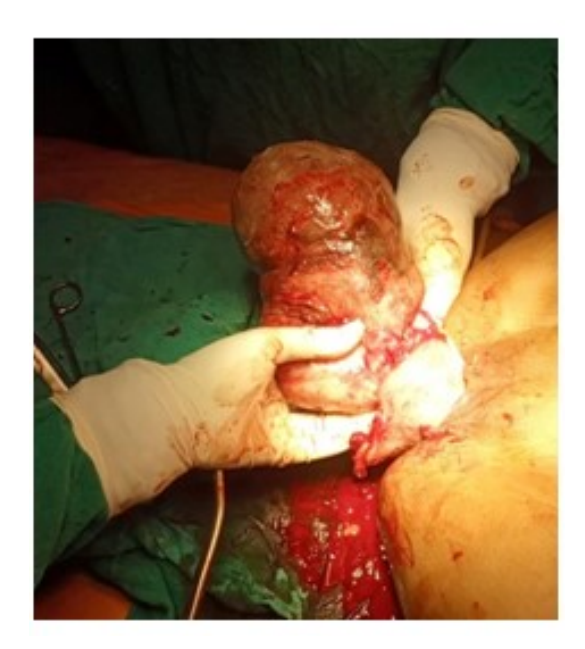
Figure 2,3,4. Showing Resection of mass by clamping, ligating and cutting the edges