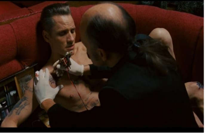
Picture 3. Clips from Eastern Promises (2007) New rank tattoo of a Russian gang