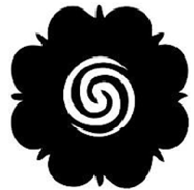
Diagram 4. A common Bunga Terung design

In Kuching Sarawak, the response was good with 60% of people view tattoos in a positive light. To question 1, they have answered that tattoo is not bad. To question 2-5, they have answered yes, showing that they have clear understanding of tribal tattoos, and their difference from gang tattoos. Answering disagree to question 6 & 7 (tattoos are bad when it worn by a convict, tattoos that we know today have significant link with gang/clan), they understand that tattoos act as life stories on one's body, with no other criminal meaning. Because of their exposure to the various forms of tattoos on the bodies of Kuching population, they answered 'agree' to questions 8 & 9 (tattoo is a form of self-expressive art today, tribal tattoos are no longer exclusively a ritual tattoo) signifies their acceptance and understanding that tattoo has become part of everyday, and is not something to be afraid of, but rather something that has become a heritage.