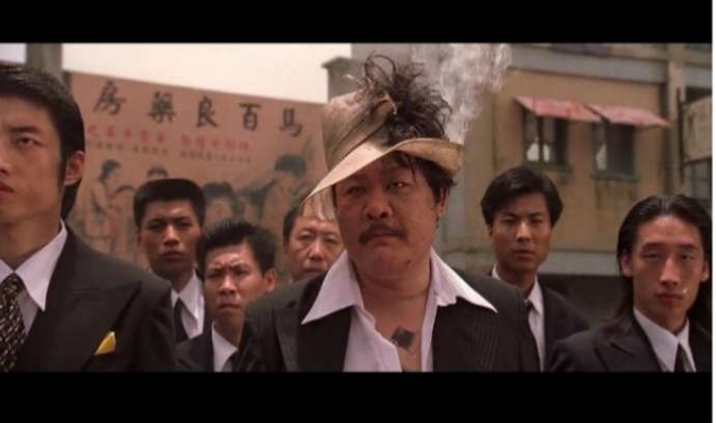
Picture 2. Clips from Kung Fu Hustle (2004) when axe gang come to help