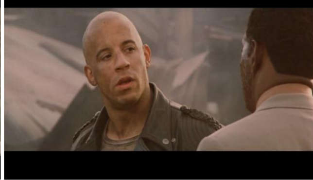
Picture 1. Clips from XXX when Xander Cage getting a new task from Agent Gibbons