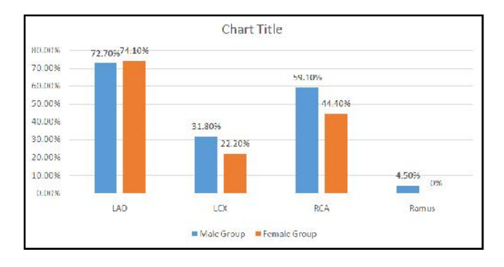
Figure 3. Coronary artery involved in significant lesion

Smoking (50%) was the number one risk factor in this study in male participants followed by hypertension (44.4%), overweight (41%) and diabetes (33.3%) where as in female participants overweight (72%) was the number one risk factor followed by hypertension (48%), smoking (32%) and then diabetes (16.7%) with family history of coronary artery disease being the least in both the groups. The coronary angiogram in female showed normal coronaries in 36% in comparsion to male which was 30.5%. Significant lesion whether single vessel disease (30.5%), double vessel disease (19.4%) or triple vessel disease (11.1%) was seen in male participants whereas female participants had 36%, 14% and 4% respectively for single, double and triple vessel disease. The most common coronary artery involved having significant disease during coronary angiogram was LAD (72.7%) followed by RCA (59.1%) and LCX (31.8%) in male group whereas in female participants also LAD (74.1%) was the most common coronary artery involved in significant disease during coronary angiogram followed by RCA (44.4%) and LCX (22.2%).