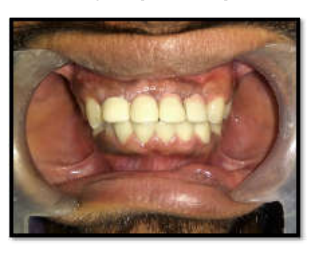
Fig 14. Postoperative