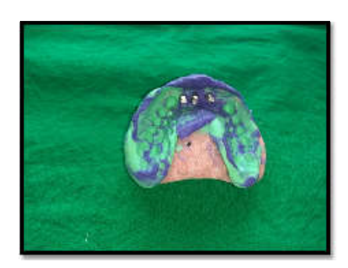
Fig 10. Placement of gingival former