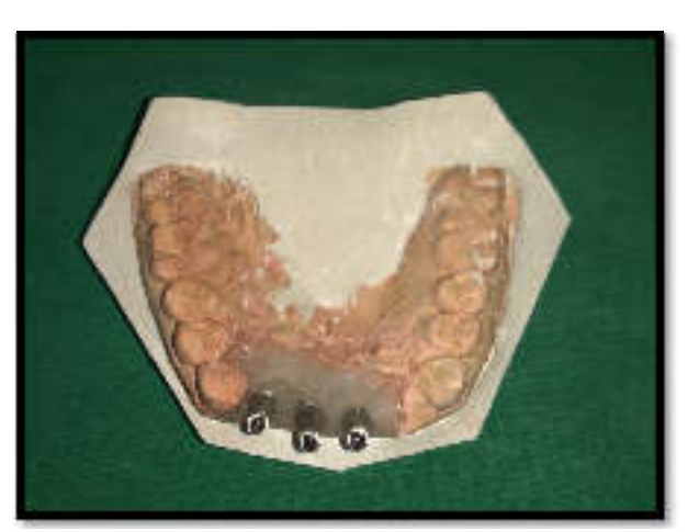
Fig 11. Cast post