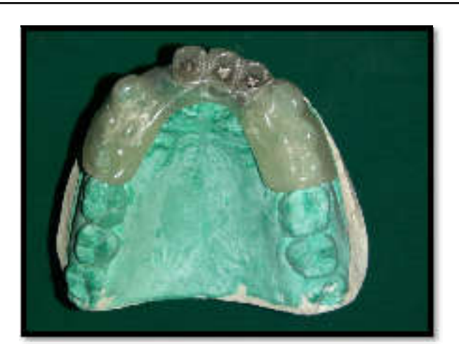
Fig 2. Stent preparation