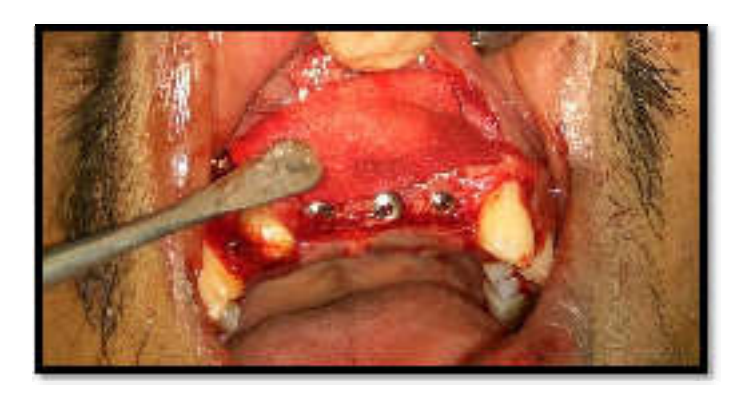
Fig 8.Pla cement of GTR membrane