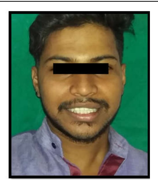
Fig 15. Postoperative smile