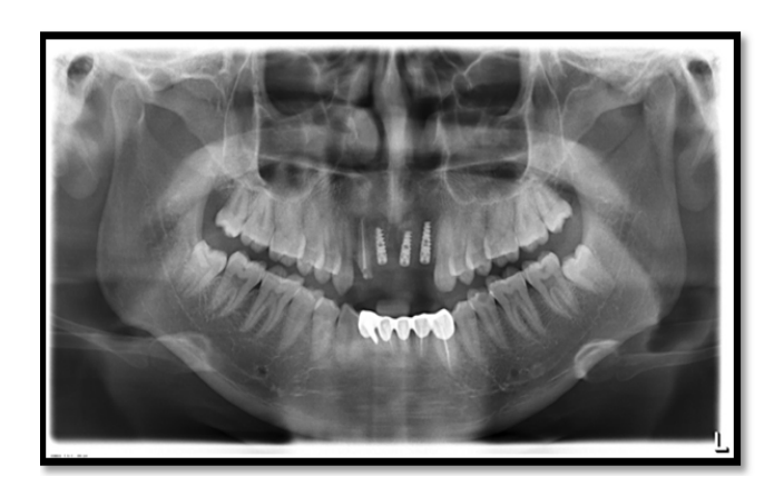
Fig 16. Postoperative radiograph

In this case report, delayed loading protocol was followed seeing the clinical condition and available bone present at missing teeth to get good treatment aesthetic result. In this case, has many biological advantages such as preservation of the natural dentition and supporting periodontium, improved aesthetics, improved hygiene accessibility, and less long-term costs are compare to traditional implant placement (Tuna, 2011). We felt an Implant would have been one of the best option in Aesthetic zone. Proper prosthetic planning must also be followed to maximize aesthetics and function outcome of this therapy. The surgeons or implantologist must consider the time needed for implant ossointegration after implant placement and soft-tissue healing, creation of emergence profiles, occlusal forces in relationship to progressive loading, and occlusal forces on the final restoration.