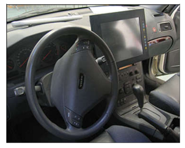
Figure 3. The interior of the car with the final LCD-screen installed

Validity and Reliability: We aimed to test which prototype the users preferred and what could be improved. How well it functioned in practice was evaluated through testing if the