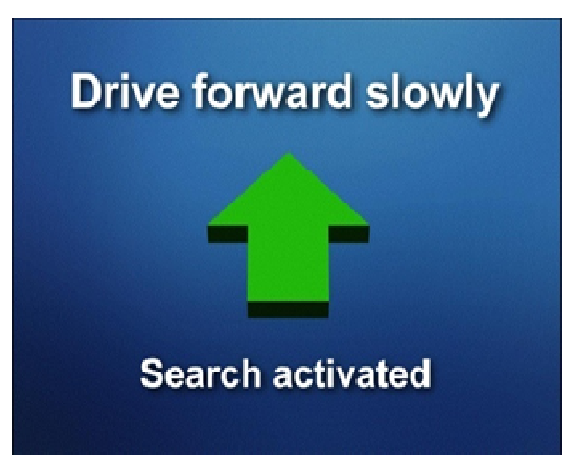
Figure 2. The first screen from the final interface