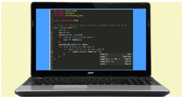
This AI-powered auto completer tool can speed up your coding

A supervised learning algorithm analyzes the training data and produces an inferred function, which can be used for mapping new examples.