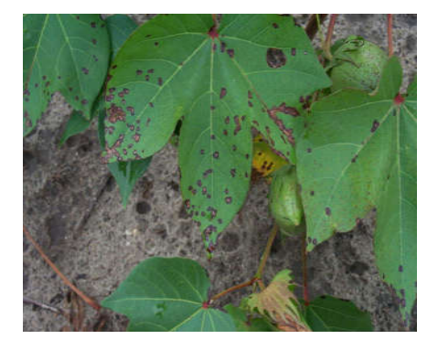
Figure 3. Bacterial leaf blight