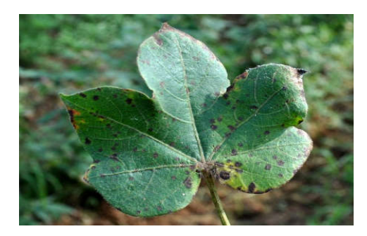
Figure 1. Alternaria Leaf Spot