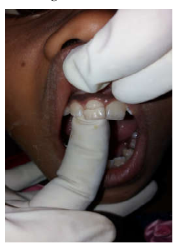
Fig. 8. try in