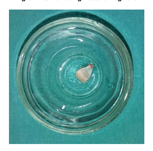
Fig. 4. Fracture fragment in normal saline