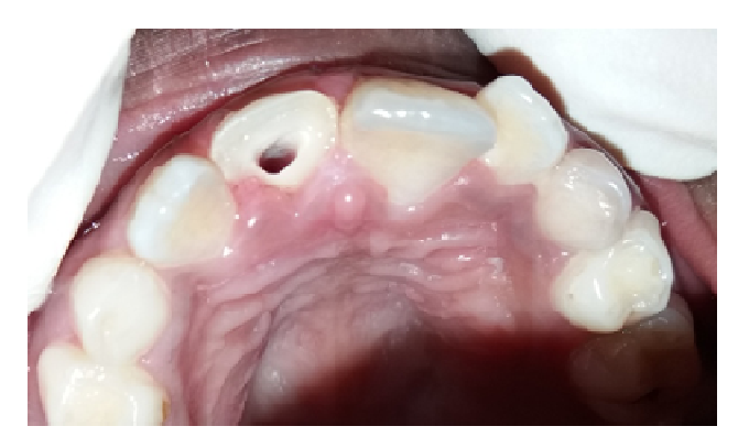
Fig. 5. Complete pulp removed