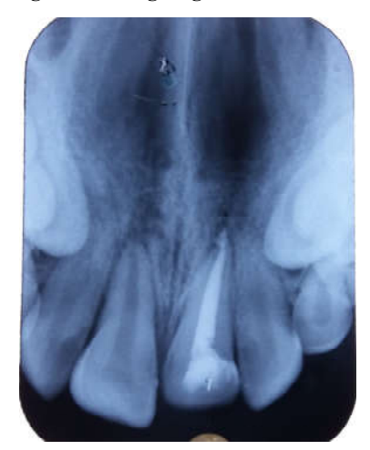
Fig. 7. Obturation