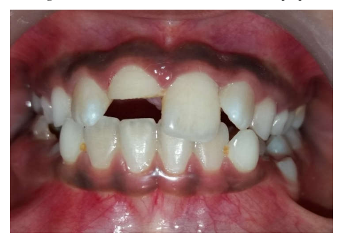
Fig. 3. After removing fracture fragment