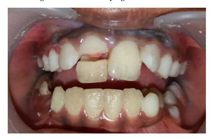
Fig. 2. Fracture line involve enamel dentin and pulp