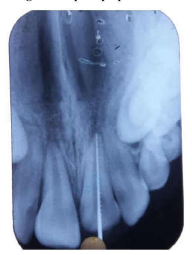
Fig. 6. Working length determination