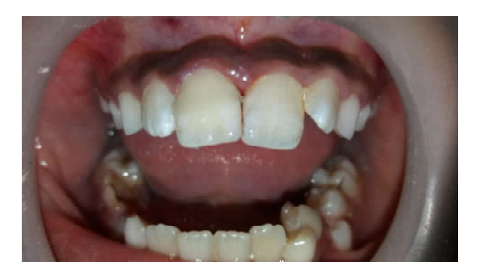
Fig. 9. After reattachment