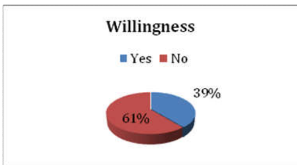
Figure 1. Distribution of willingness for treatment amongst participants

The responses were obtained from the questionnaire. Maximum participants (53%) had the knowledge of replacement of missing or lost part from the treating doctor. Majority of participants (61%) were not willing for taking the treatment (Figure 1). The reasons being economic problems (42%), Frequent visits (8%), difficulty in wearing (2%) (Figure2)