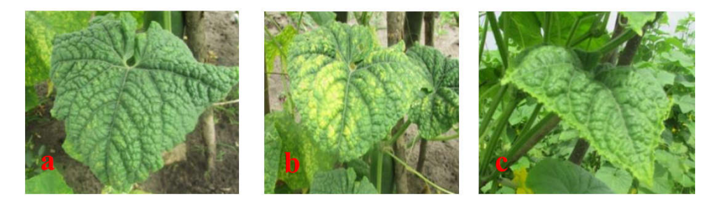
Fig. 2. Blistering of infected leaves. a: Blistering plus leaf reduction. b: Blistering plus mosaic. c: Blistering plus margin stricture