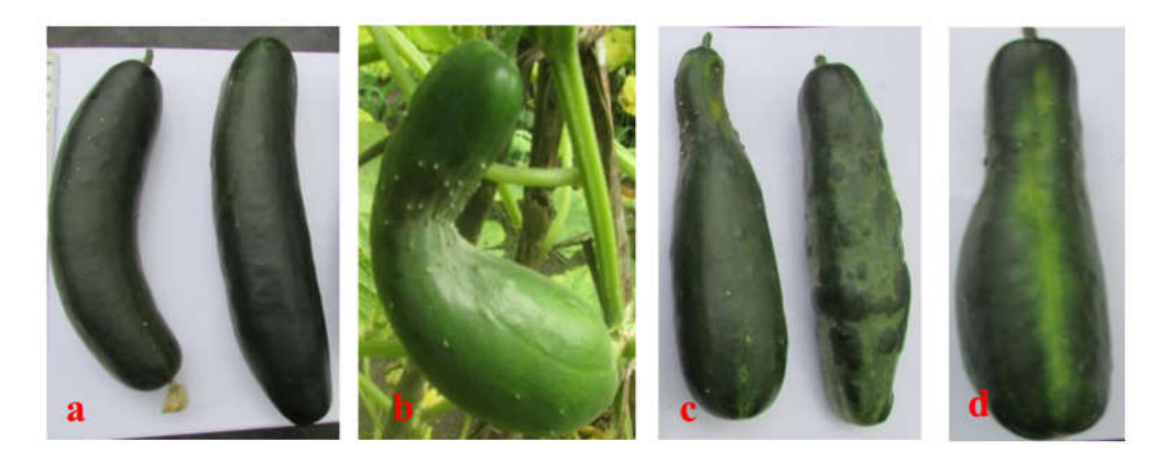
Fig. 4. Cucumber fruits. a: Apparently healthy fruit. b: Deformed reduced fruit. c: Atrophied fruit faded at the end with blisters d: Chlorosis in longitudinal strip of the fruit

Fig. 3. Cucumber plants. a: Apparently healthy plant. b: Plants with chlorotic leaves. c: Plants with mosaic-infected leaves