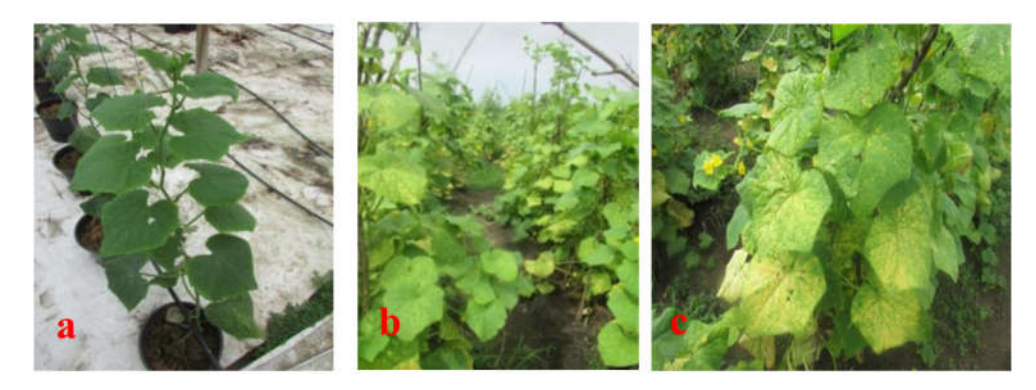
Fig. 3. Cucumber plants. a: Apparently healthy plant. b: Plants with chlorotic leaves. c: Plants with mosaic-infected leaves