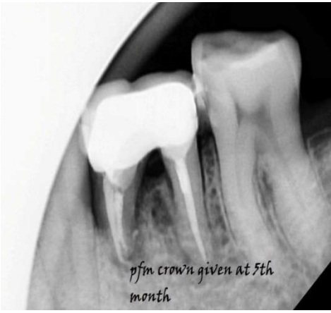
CASE 2: In this case report a 28 year old male reported to dental section with the complaint of pain in the lower right

posterior tooth region since 1month. Clinical examination revealed a grossly carious right mandibular second molar with pulpal exposure. Vitality tests conducted on the tooth gave a lingering pain response. A diagnosis of irreversible pulpitis was established.