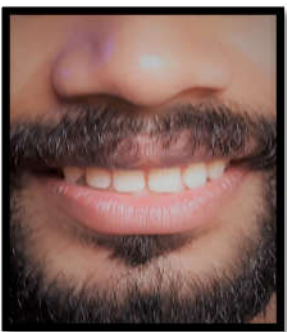
Post-operative after 2 weeks