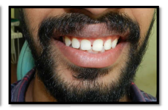
Post-operative after 1 month