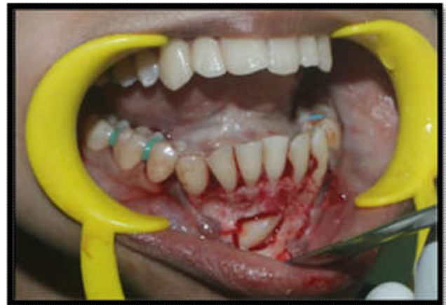
Figures 1. 2. Pre-operative and operative pics of canine impaction done with pre-operative dexamethasone