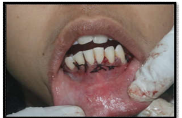
Figures 3.4. Operative and post-operative pics