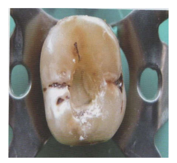
MTA placed over the