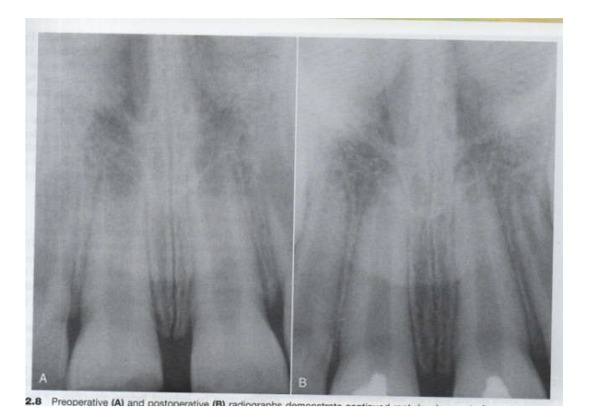
Pulpotomy procedure on both Incisors