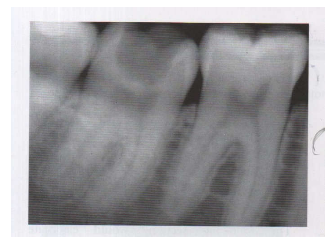
Deep carious lesion in a Mand Molar

Indirect Pulp Capping: It is defined as a procedure wherein the deepest layer of the remaining affected carious dentin is covered with a layer of biocompatible material in order to prevent pulpal exposure and further trauma to the pulp. Indirect pulp capping should be contemplated only if there are no clinical signs and symptoms of irreversible pulpitis. In a deep dentinal lesion, there is already a high likelihood of pulpal involvement from the carious challenge, but it is the level of carious activity that is probably the greatest determinant of successful outcomes for indirect pulp capping. In slowly progressing lesions or those in which caries has been either arrested or reduced in activity, a better prognosis is likely. The use of a step-wise technique for excavation of caries, in which caries is removed in increments over several visits rather than in one visit, reduces the risk of accidental mechanical exposure of the pulp and may also slow or arrest lesion development, leading to an improved prognosis for pulp vitality. Current evidence favors use of a step-wise excavation technique over indirect pulp capping.