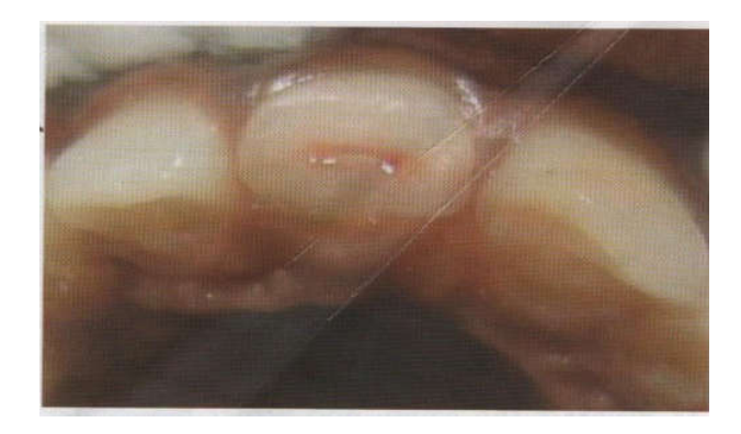
Pulp exposure in a Max C.I