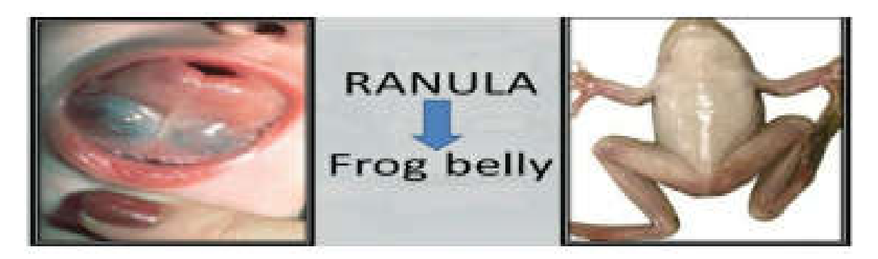
Variable factors and it's incidence of ranula and it's types