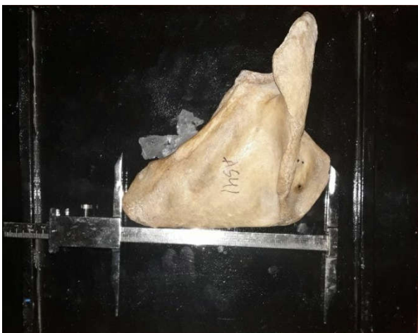
Fig. 2. Shows procedure of measurement of scapular length from point C to point D