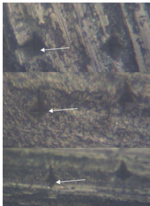
Fig. 2. Microscopic images of enamel surface after indentation for microhardness determination (A-pretreatment, B- after bleaching, C- post bleaching)

After each bleaching procedure, the gel was removed with a cotton pellets and specimens were washed and dried with an air/water syringe for five seconds. Specimens were then stored in artificial saliva at 37°C. Specimens were bleached for 21 consecutive days. After bleaching on 21 st day microhardness testing was done (Fig 2-B).