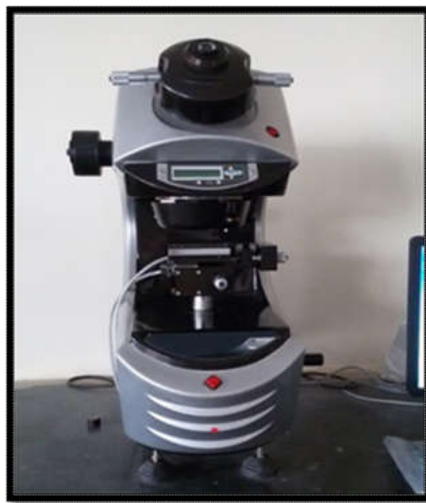
Fig 1. Microhardness tester machine for VHN ( DV 3000)

Baseline VHN were determined prior to bleaching using microhardness tester (Fig 1). 3 indentations were performed on an area 5x3 mm in the middle third of the labial enamel surface of each specimen (Fig 2-A). The long axis of indenter was kept perpendicular to the labial surfaces. The first 3 baseline measurement were taken on the most mesial part of the central area. VHN values were determined (kg/mm 2 ) at a load of 100gm with indentations for 5 sec. Labial enamel surfaces were dried with cotton pellets. Labial surfaces were isolated with jig made by thermoplastic sheet. The labial surfaces of the specimens were covered with a 1 mm layer of the bleaching gel. Specimens were bleached for four hours.