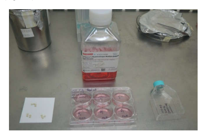
Figure 2. Murine t3t fibroblasts cultured with PEEK extract

Murine normal fibroblast cells (NCCS, Pune) were cultured at 37°C under a humidified atmosphere of 5% CO<sub>2</sub> and 95% air and were grown in DMEM (Dulbecco's modified eagle medium), High Glucose medium (HIMEDIA Laboratories, Mumbai) supplemented with 10% fetal bovine serum (HIMEDIA Laboratories, Mumbai) and 1% Antibiotic Antimycotic solution (HIMEDIA Laboratories, Mumbai) (Figure 2).