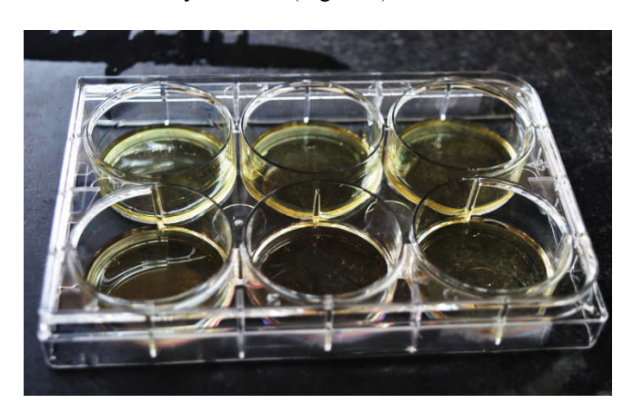
Figure 3. Colony formation assay carried out in 6 -well plates

A qualitative assessment of the cell culture groups was performed using the Colony Formation Assay. The fibroblastic cells were grown up to 80% confluence and were trypsinized and seeded in 6-well plates in triplicate at a density of 500 cells/well for 2 days at 37°C (Figure 3).