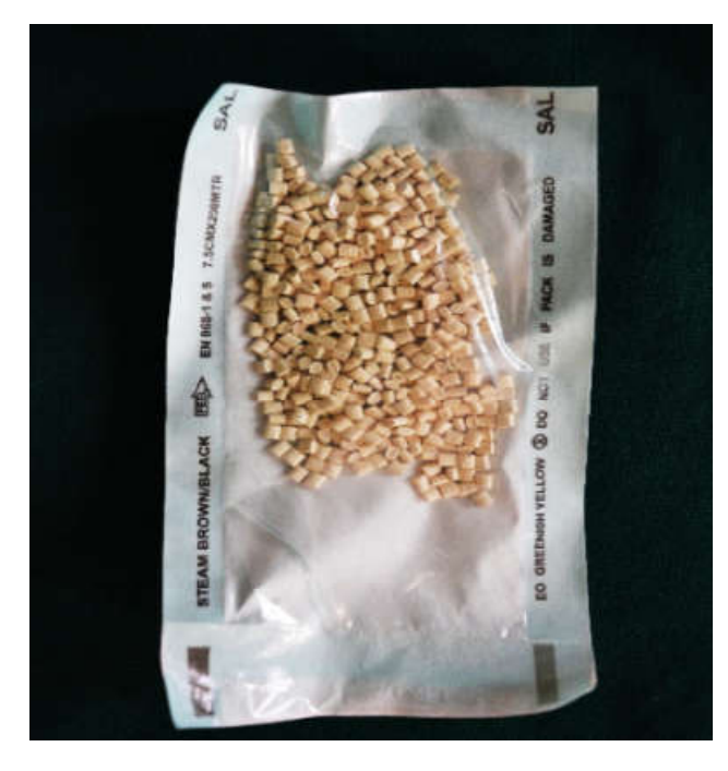
Figure 1. Autoclaved PEEK granules