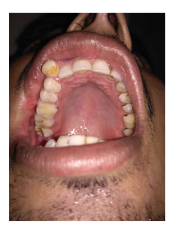
Fig. 4. Labially tilted tooth irt 13