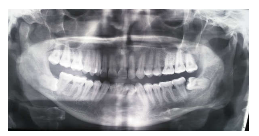
Fig. 7. Orthopantomograph