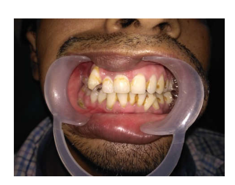
Fig. 5. Gingival Recession