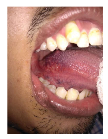
Fig. 6. Foliate Papillitis