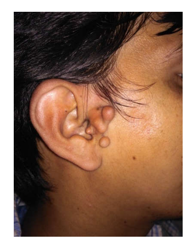
Fig. 3. Rudimentary Pinna