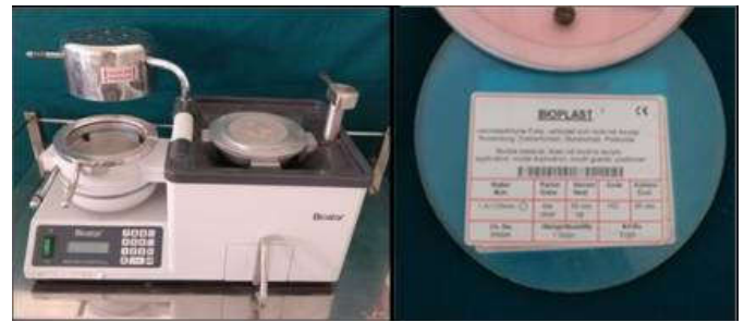
Figure 3. Bio star pressure moulding device, bioplate sheet for semirigid cap splint

As the pediatric mandible has high osteogenic potential non-surgical conservative management was the treatment of choice. 31 was in the line of fracture and hampered the fracture fragments reduction. Hence 31 was extracted under local anesthesia. Displaced fractured fragments were then reduced with bi-digital manipulation under local anesthesia. Upper and lower alginate impressions were made. The mandibular occlusal plane was checked against the maxillary cast and split cast method was adopted to regulate the occlusion extra orally. The mandibular cast with adjusted occlusion was used to fabricate a modified semi rigid splint using Bio plast foil (code 162, with the dimensions of 1.5×125 mm. Figure 3). The semi-rigid splint was used to accurately and non-surgically reduce the fracture fragments as well provide immobilization for healing. The splint was cemented with help of luting GIC (VOCO MERON) (Figure 4). A 5-day course of antibiotic and analgesics was prescribed. Splint was maintained for duration of 3 weeks.