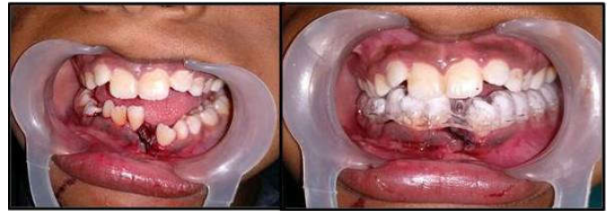
Figure 4. Extracted 31, cemented Semi rigid cap splint