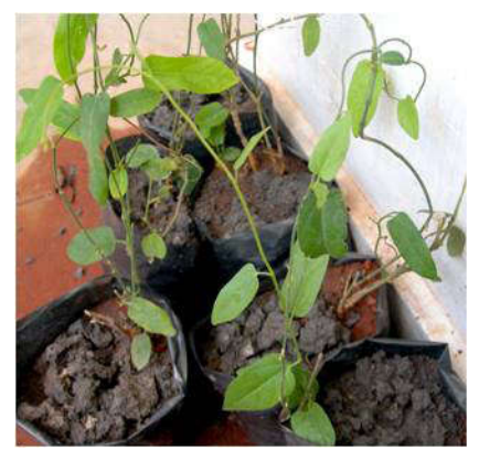
Plate 2. Regenerated plant-lets

higher in MS basal medium. Different explants from Aristalochia indica like shoot tips, nodal segments and leaf disc were used to initiate cultures. Shoot tips and nodal segments showed elongation without multiplication when either NAA or KIN was used in MS medium. Shoot multiplication was obtained when cytokinins like BAP was used (Plate1 – C to F). BAP (1 - 5 mg dm<sup>-3</sup>) alone also induced multiple shoots (7 - 8) in Aristolochia . Manjula et al. (1997) reported shoot multiplication of Aristolochia with 4 mg dm-3 BA, but another cytokinin, thidiazuron (1 - 6 mg dm<sup>-3</sup>)