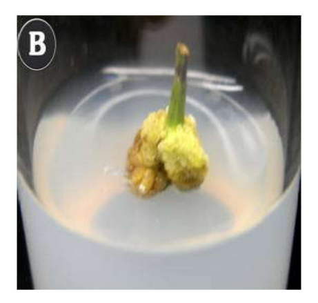
Plate 1B: Callus induction from base of the nodal explant