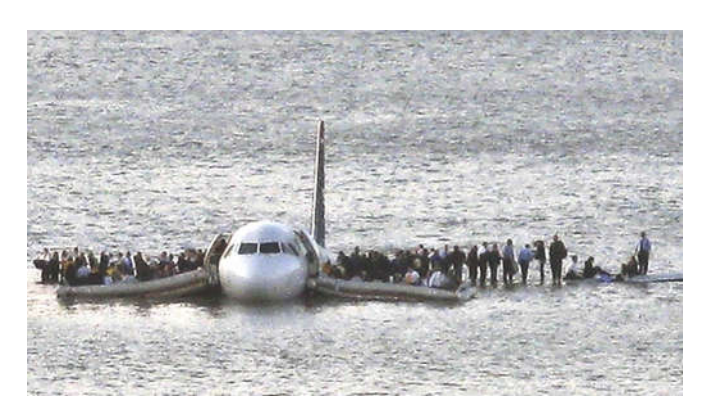
Photo 3. US Airways Flight 1549, aircraft on Hudson River, with occupants on the wings and slide/rafts after the evacuation (NTSB, 2010, p. 5)

One of the most famous flights in recent history, involved an Airbus 320, operated by US Airways as Flight 1549, which was forced to land on the Hudson River after being struck by migrating Canada geese. After departing LaGuardia Airport in New York, USA, on 15 January 2009, the aircraft collided with a flock of Canada geese causing some of the birds to be ingested into both engines. The pilots, assisted by ATC, were faced with little time to determining the safest place to the land the narrow-body jet in the most populated city in the USA. Three minutes and thirty second after the birds hit the aircraft it landed on the Hudson River. "The 150 passengers, including a lap-held child, and 5 crewmembers evacuated the airplane by the forward and overwing exits. Seven New York Waterway ferries, two US Coast Guard small boats, and a NY Fire Department fire rescue boat responded to the crash rescuing passengers from the sinking aircraft (NTSB, 2010). One flight attendant and four passengers were seriously injured, and the airplane was substantially damaged" (National Transportation Safety Board, 2010).