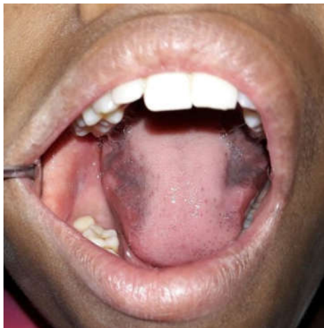
Figure 3. Preoperative intraoral view

Histopathological examination showed fibro cellular connective tissue stroma with small island of hyperchromatic cuboidal and columnar odontogenic epithelial cells. Also