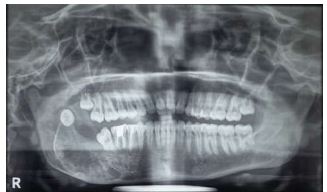
Figure 6. OPG after 10 months of surgical decompression

Decompression was done for 10 months, during which periodic orthopantomographs were taken. (Figure 6) Ten months after the decompression, her facial asymmetry had regressed considerably and there were signs of remodelling of the mandibular bone.