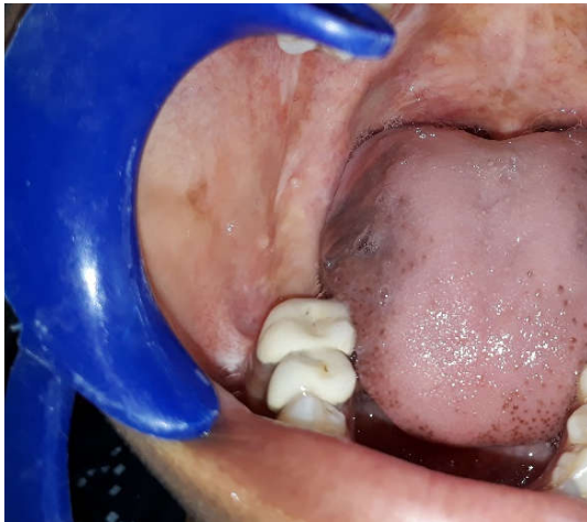
Figure 8. Post enucleation intraoral view