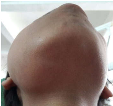
Figure 2. Preoperative extraoral wormian view