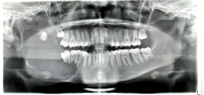
Figure 4. Preoperative OPG view

showed one follicle lined peripherally by cuboidal hyperchromatic cells and centrally placed loose stellate reticulum like cells with cystic degeneration suggestive of Unicystic ameloblastoma of mural variant.