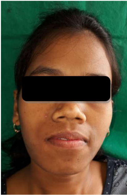
Figure 7. Post enucleation extraoral view