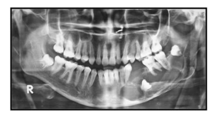
Figure 3. Orthopantomogram showing multilocular radiolucency with sclerotic border extending from 33 to 38 region along with missing 35, impacted 38 and 75 pushed towards lower border of mandible showing complete root resorption