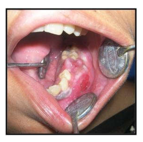
Figure 2. Intraoral photograph showing swelling in 34 to 37 region with erythema and ulceration of overlying mucosa in buccal gingiva of 34 & 35 along with indentation of opposing maxillary teeth