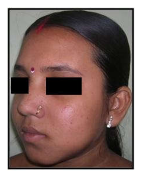
Figure 1. Extraoral photograph showing diffuse swelling in left mandibular body region

stellate reticulum in the centre (Figure 5). No hard tissue structures or mitotic figures were evident. The overall histological features were corroborative to the diagnosis of AF. Thereafter, thepatient was referred to the department of Oral & Maxillofacial Surgery for further surgical management where enucleation with curettage of surrounding bone and removal of 33 to 38 along with impacted 75 was done. The patient did not report back for further follow up.