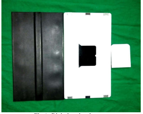
Fig A. Digital occlusal sensor

males and females group. Males were found to have greater Maxillary Inter Canine width and Maxillary Inter Second Molar arch with p value 0.005.Maxillary inter premolar and mandibular canine premolar and molar widths were also found to be greater for males than female but the difference was not statistically significant.