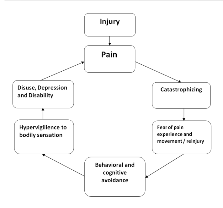
Figure 1. Vicious cycle of Pain

The TSK is a self-completed questionnaire and the ranges of scores are from 17 to 68 where the higher scores indicate an increasing degree of kinesiophobia. Lower back taping technique is designed to support the low back, improve postural alignment and reduce stress on the spine during activity. They can be used for both treatment and prevention of recurring low back injuries, particularly associated with poor posture or caused by excessive bending forward, sitting or lifting activities by stabilization and restriction of range of motion of joint.