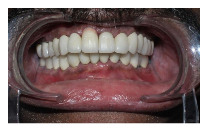
Case Report V : Frenectomy

Case Report IV: Picture 7: Postoperative view after restoration