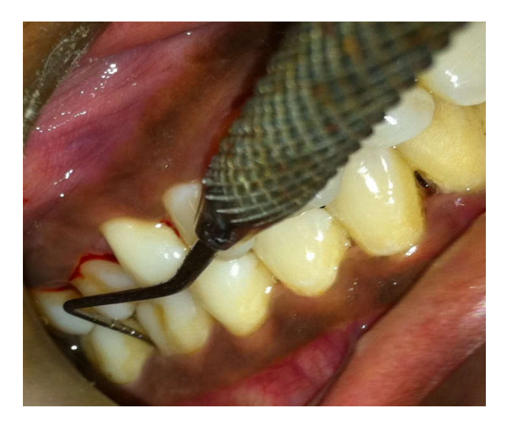
Case Report III: Picture 2: Sulcular debridement done using laser