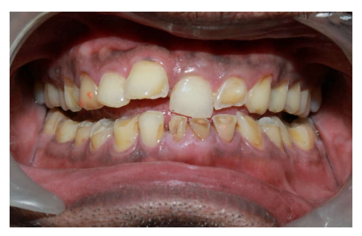
Case Report IV: Picture 2: Crown Preparation done