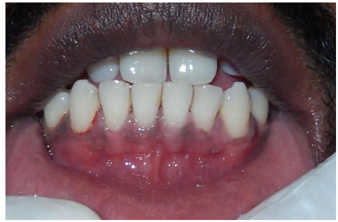
Case Report III: Surgical Pocket Therapy

A 32 year old female patient was referred for management of bleeding gums. On examination, she was found to have deep pockets of 6mm in posterior molar region on all quadrants. A surgical pocket therapy was planned using laser, after successful non- surgical preparation. Postoperative review revealed an uneventful healing and reduced pocket depths.