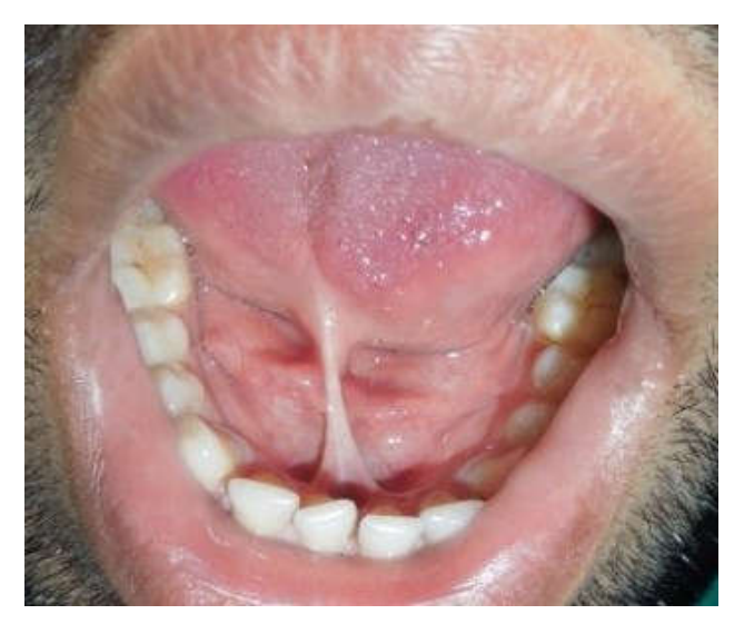
Case Report V: Picture 2: Tongue protrusion affected by high lingual frenum attachment