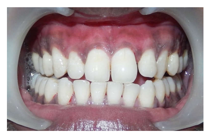
Case Report II: Picture 3: Postoperative view of lower arch after depigmentation