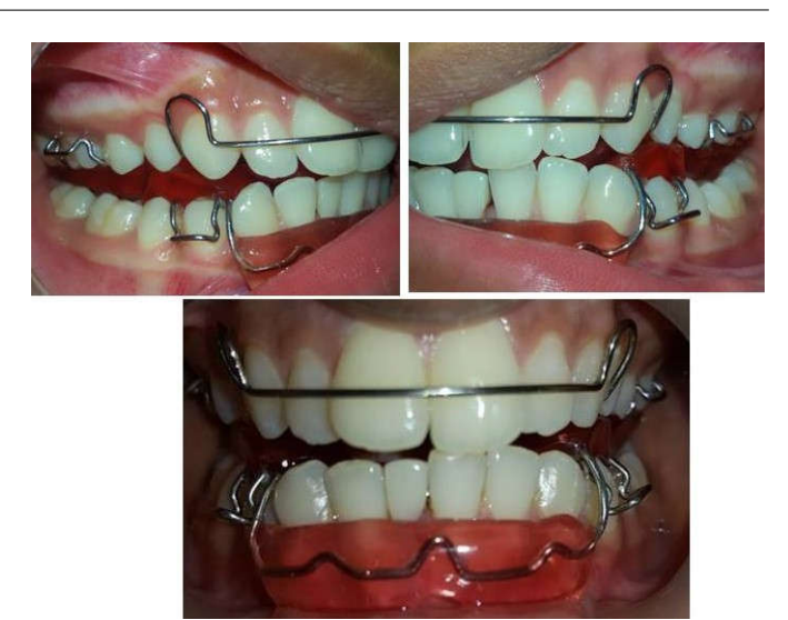
Twin block appliance delivered with replacement of 41 and lower lip pads