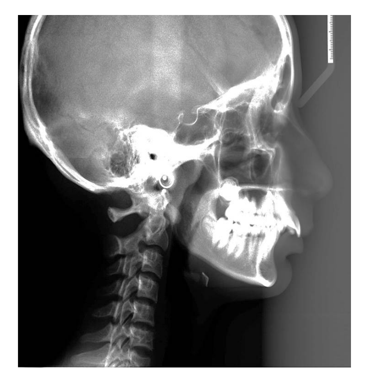
Preoperative lateral cephalogram