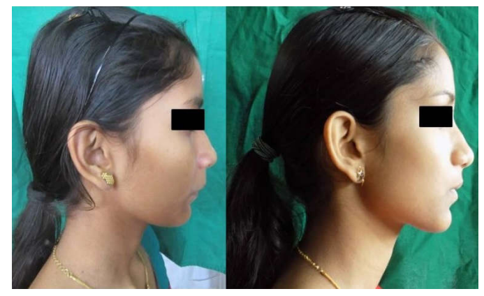
Comparison of pre and post-operative facial view