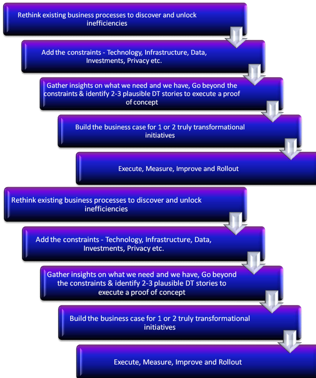
Framework of Digital Transformation of Retail Industry