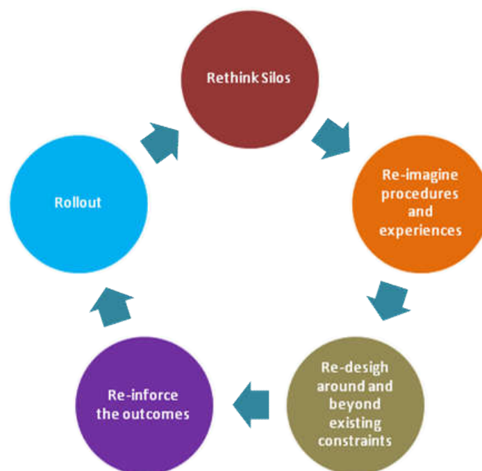
Action Plan Framework for Digital Mutation in Consumer Goods Enterprise