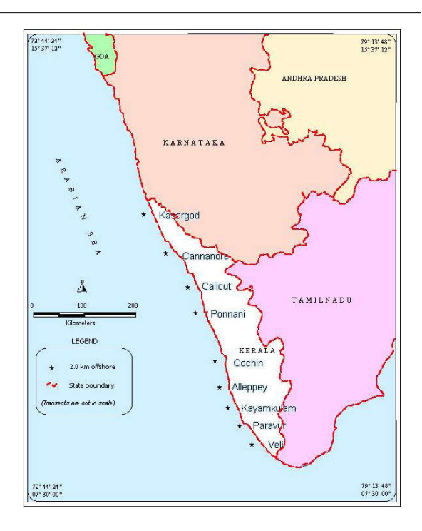
Fig.1. Location map showing sampling sites along the Kerala coast.

Water and phytoplankton samples were collected from 2.0 km offshore of nine transects along the state of Kerala starting from south Thiruvananthapuram to north Kasaragod (Fig.1) during March 2005. Oxygen was measured using Winkler's method (UNESCO, 1994). Samples for