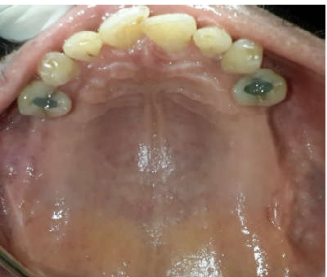
Fig.2 extraction of 26.fig.3 root canal treatment with 14, 24