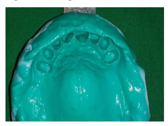
Fig.4. Putty wash impression

Wax patterns of copings were made on the stone model and the plastic form of the Ceka attachments were attached to the copings using a dental surveyor. Custom tray was fabricated on diagnostic cast to make the pickup impression. Metal try-in of coping with Ceka attachments were done in patient's mouth to evaluate fit of casting (Fig.5). Ceramic layering was done and tried in patient's mouth (Fig.6). Fabricated metal ceramic crowns were provisionally cemented and pick up impression was made using medium body impression material in custom tray (Fig.7). Master cast was obtained from this impression which was followed by the fabrication of cast partial denture frame work.