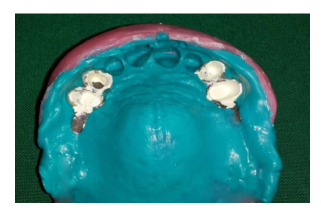
Fig.7 pick-up impression

Once the frame work of cast partial denture was fabricated, it was tried in patient's mouth to verify the fit (Fig.8). After that occlusal rim was adapted on framework and Maxillomandibular relations were recorded (fig.9). Teeth arrangement and try-in was done (Fig.10), followed by the acrylization of cast partial denture using high strength heat cure acrylic resin.