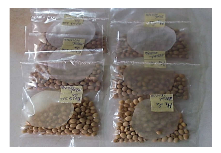
Figure 1. Treated seeds and stored in storage plastic

Vigour index (VI) = Percent germination of seed \times ( Root length + Shoot length ). In both experiment, untreated seeds for each variety and stored at the same periods served as control. Complete randomized design (CRD) was used in the experiments and each treatment was repeated thrice.